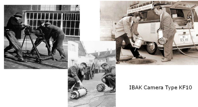
IBAK Camera Type KF10